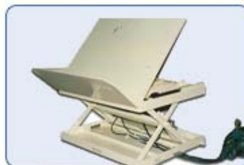
Scissor Lift Tables