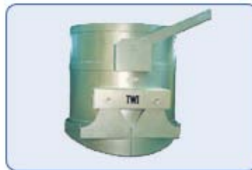
Buckets & Hoppers